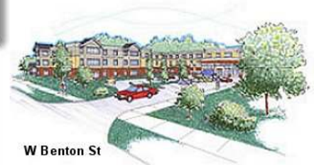
W Benton St

Melrose Exit R on Morman Trek Blvd L on W Benton St 1.5 blocks past Sunset light Oaknoll = left side Add'l Parking on George St