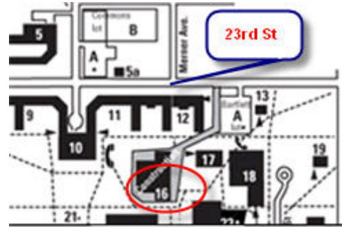
16 = ITTC Building